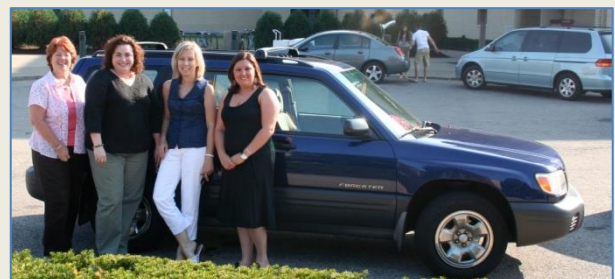
One of the carpool groups

Collectively these groups are keeping an estimated 470 vehicle trips off the roadways each day. Additionally, they free up an average of 235 on campus parking spaces each week day.