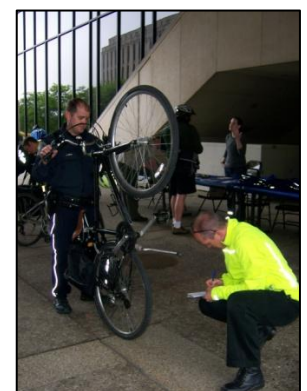
Campus Bike Registration & Safety Day

CommuteInfo c/o Southwestern Pennsylvania Commission Two Chatham Center – Suite 500 112 Washington Place Pittsburgh, PA 15219-3451 www.CommuteInfo.org 1-888-819-6110